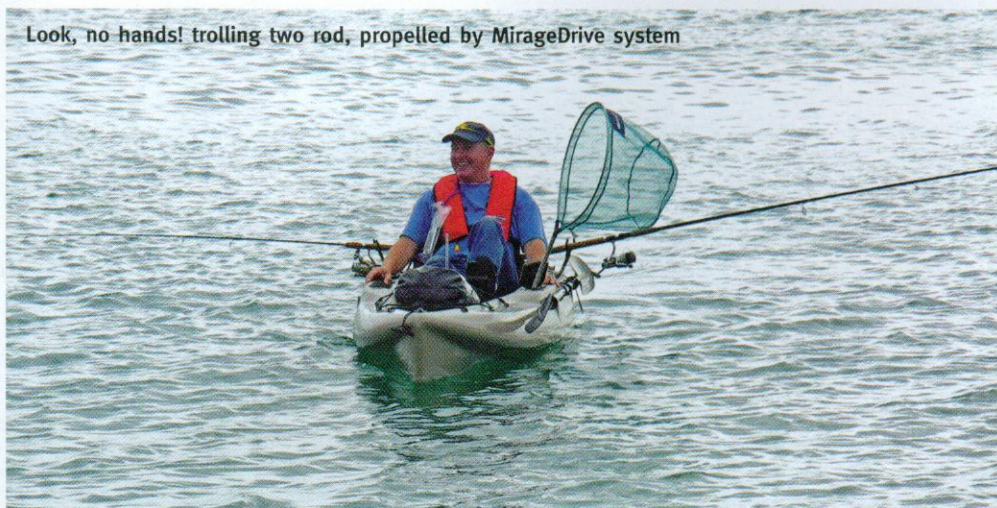
Look, no hands! trolling two rod, propelled by MirageDrive system

Check out the Hobie Kayak and MirageDrive at www.hobiecat.com The site has a video clip of the MirageDrive system in action, or give Steven a call on 01803-832135 or email: admin@oasispromotions.fsnet.co.uk